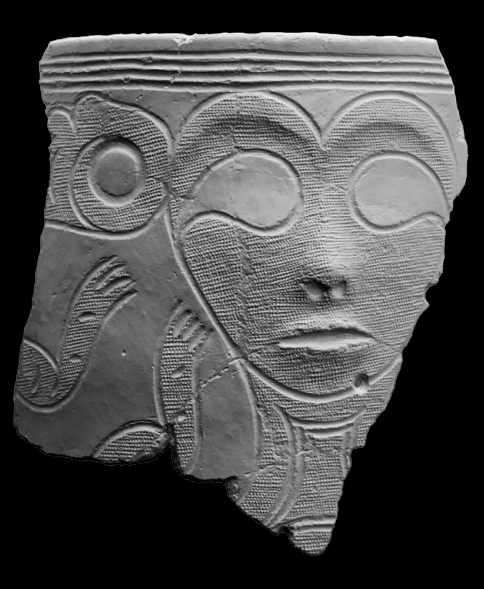
Ceramics of Voznesenovskaya culture, Russia

For order and information: atelier.etno@gmail.com